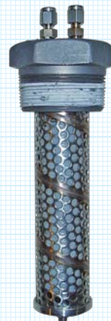
Dilution Sample Probe