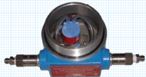
XP Air Pump with cover removed